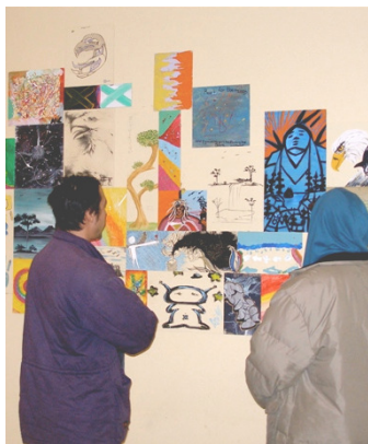
Participants in recent art workshops proudly showing their art

chapel and we invite you to come and enjoy their visions all 200 of them!