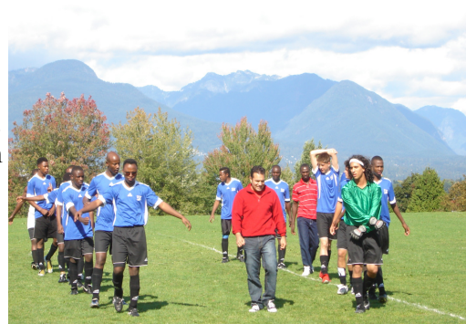
Strathcona United in their new kit warming up before the game on September 19th

Strathcona United Football Club played its second game of the season on Saturday, September 19th and won 4-1. The emergence of this new team in Division 3 of the Metro Vancouver Soccer League is a source of delight for First United. Players range in age from 16-30 and are residents of Strathcona or the Downtown Eastside. Most of them are immigrants with the majority being from East and West Africa. A small percentage of the players are from Mexico. Almost all members of the team have lived lives of tragedy and trauma and are in Canada trying to make their way to a better future.