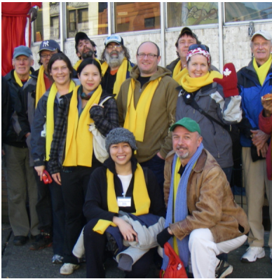
Community members wearing their "Share the Gold" scarves as they gathered on February 18th to attend

Share the Gold is a call to leverage creativity, energy and commitment to address the Olympian challenge of alienation, addiction, poverty and homelessness