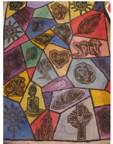
A portion of the three panels flanking the Totem Pole