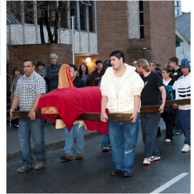
The Totem Pole being carried from the Parking Garage where it was carved and prepared